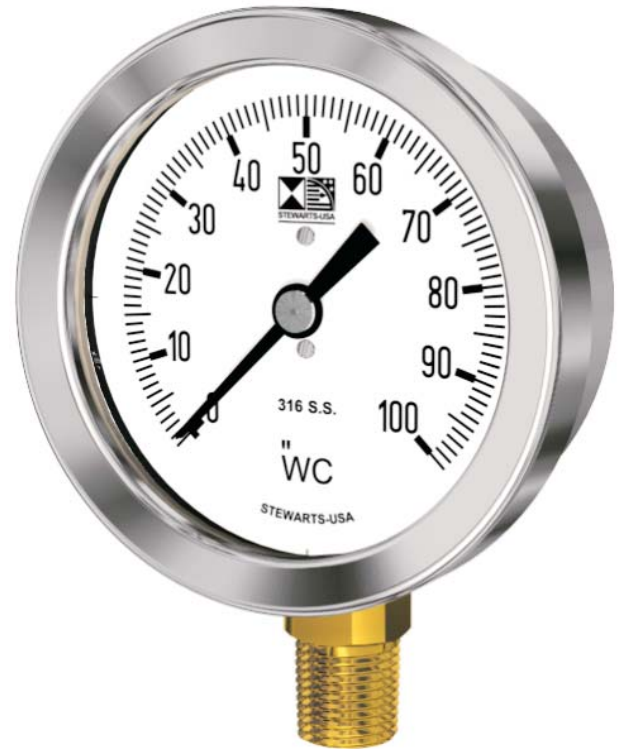
Model Shown: 45B-100"WC To order other models by part no, See Below.

Standard Direct Mounted (Bottom Vertical). LB: Lower Back Connection. FP: Front Flange for Panel Mounting. C: C-Clamp Fixing for Panel Mounting. R: Rear Flange for Wall Mounting.