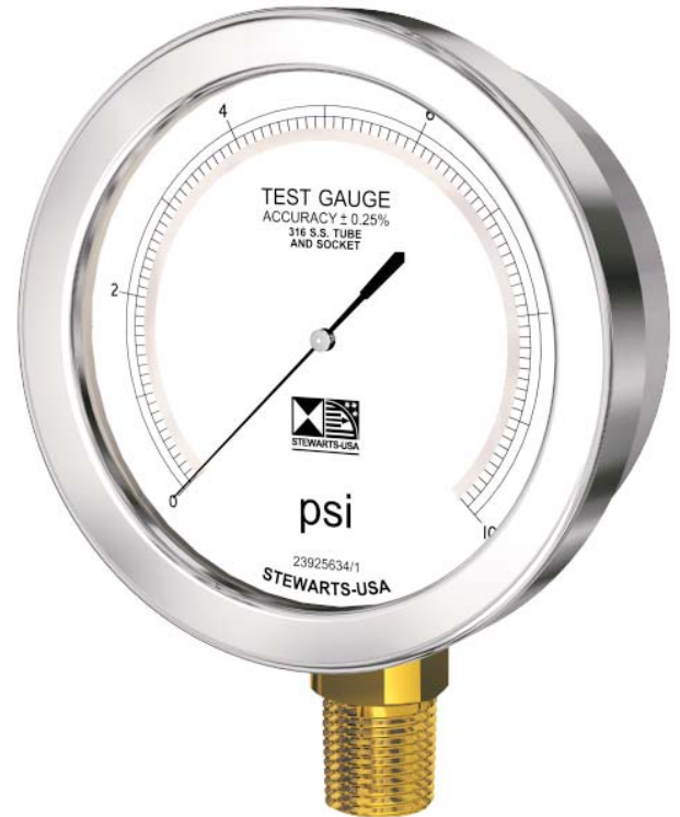
Model Shown: 45BT-10 To order other models by part no, See Below.

Additional Code Suffix for dual scale ranges (B = BAR/PSI) (K = KPA/PSI) ( \text{KgCm}^2 = \text{KgCm}^2 / \text{PSI} )