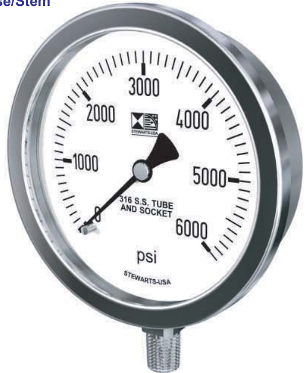
Model: 46S-6K To order other models by part #, See Below