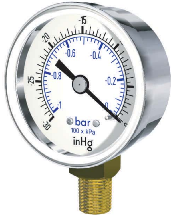
Model: 11B-V30 To order other models by part number, see below.

No Code: Bottom Connection CB: Center Back Connection FP: Front Flange for Panel Mounting C: C-Clamp Fixing for Panel Mounting