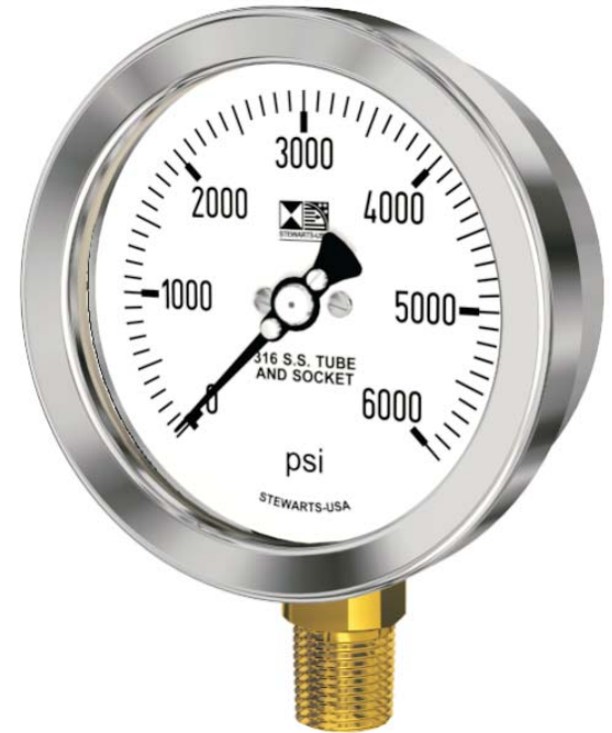
Model Shown: 41B-6K To order other models by part no, See Below.