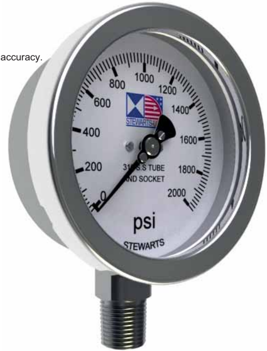
Model shown is 41S-2K To order other models by part no, See below.

Text in Red denotes HIGH PRESSURE CONNECTIONS REQUIRED