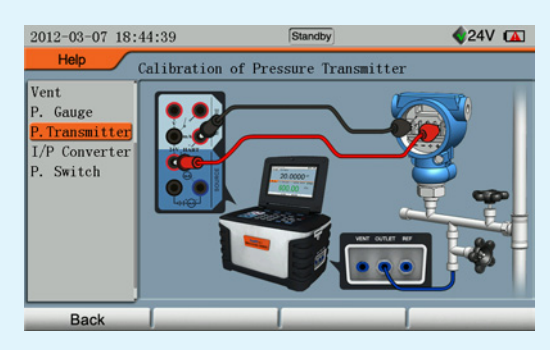
Built-in User's Manual