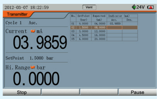
Pressure gauge / transmitter / switch calibration