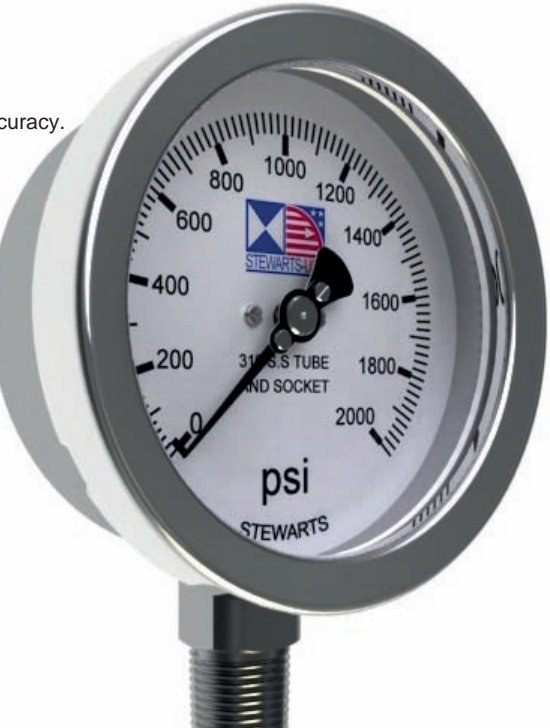
Model shown is 41S-2K To order other models by part no, See below.