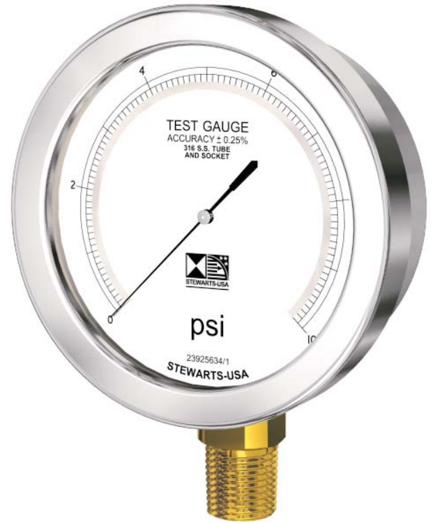
Model Shown: 45BT-10 To order other models by part no, See Below.

Additional Code Suffix for dual scale ranges (B = BAR/PSI) (K = KPA/PSI) ( \text{KgCm}^2 = \text{KgCm}^2 / \text{PSI} )