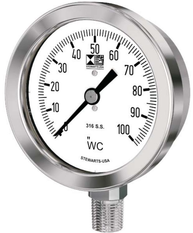
Model Shown: 45S-100"WC To order other models by part no. See Below.

LB: Lower Back Connection. FP: Front Flange for Panel Mounting. C: C-Clamp Fixing for Panel Mounting. R: Rear Flange for Wall Mounting.